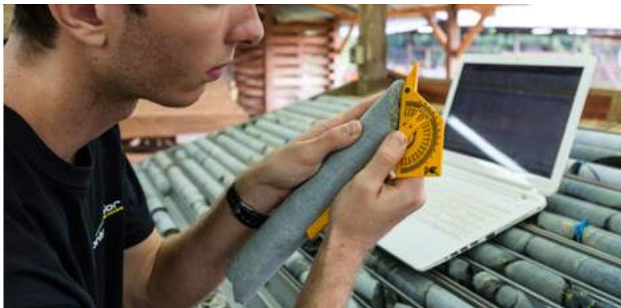
Photo: Geologists inspecting core at drill site - Montagne d'Or gold project, French Guiana

Although title to the properties has been reviewed by the Company, formal title opinions have not been obtained by the Company for most of its mineral properties and, consequently, no assurances can be given that there are no title defects affecting such properties and that such title will not be challenged or impaired. The acquisition of title to resource properties is a very detailed and time-consuming process. Title to, and the area of, resource claims may be disputed. There may be valid challenges to the title of any of the mineral properties in which the Company holds an interest that, if successful, could impair development and/or operations thereof. A defect could result in the Company losing all or a portion of its right, title, estate and interest in and to the properties to which the title defect relates.