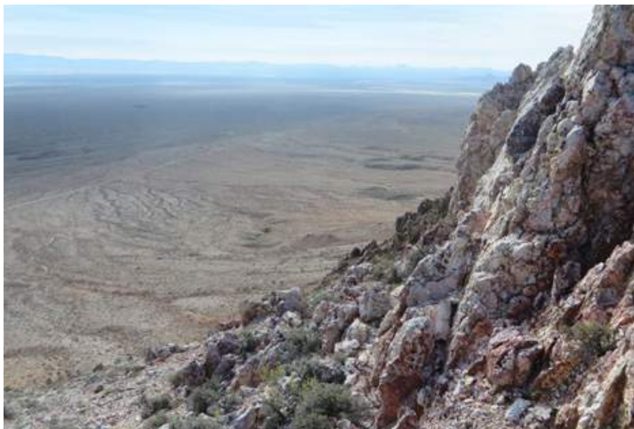
Photo: South East view towards Tonopah; country road in the foreground - Eastside project, Nevada