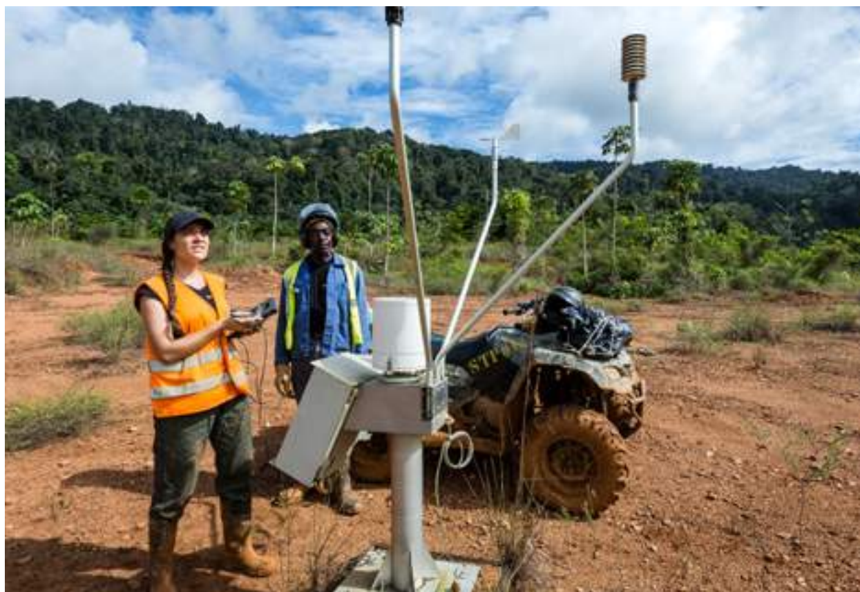
Photo: Weather monitoring station - Montagne d'Or gold project, French Guiana

Government approvals and permits are currently, and may in the future be, required in connection with the mineral projects in which the Company has an interest. To the extent such approvals are required and not obtained, the Company may be restricted or prohibited from proceeding with planned exploration or development activities. Failure to comply with applicable laws, regulations and permitting requirements may result in enforcement actions thereunder, including orders issued by regulatory or judicial authorities causing operations to cease or be curtailed, and may include corrective measures requiring capital expenditures, installation of additional equipment, or remedial actions. Parties engaged in mining operations may be required to compensate those suffering loss or damage by reason of the mining activities and may be liable for civil or criminal fines or penalties imposed for violations of applicable laws or regulations. Amendments to current laws, regulations and permitting requirements,