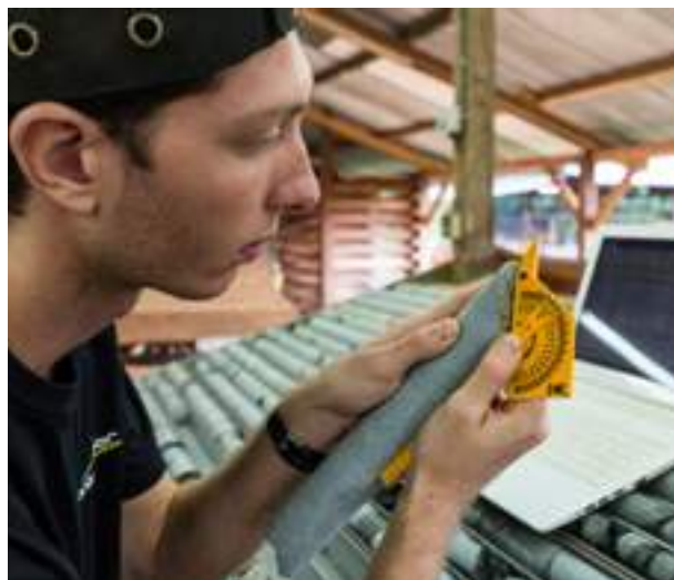
Photo: Geologist inspecting core - Montagne d'Or gold project, French Guiana