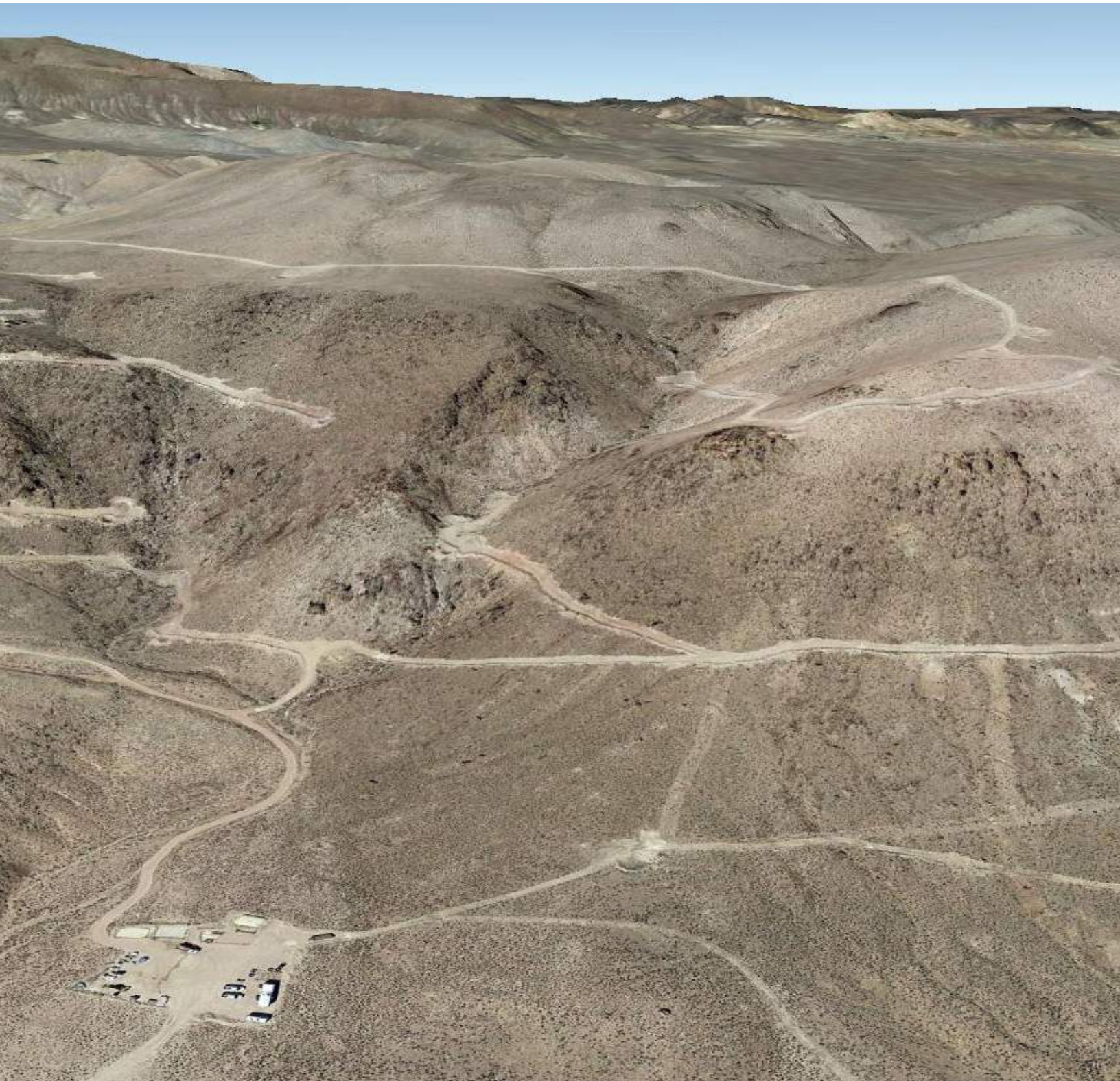
Photo: Drill pads and staging site - Eastside gold project - Nevada