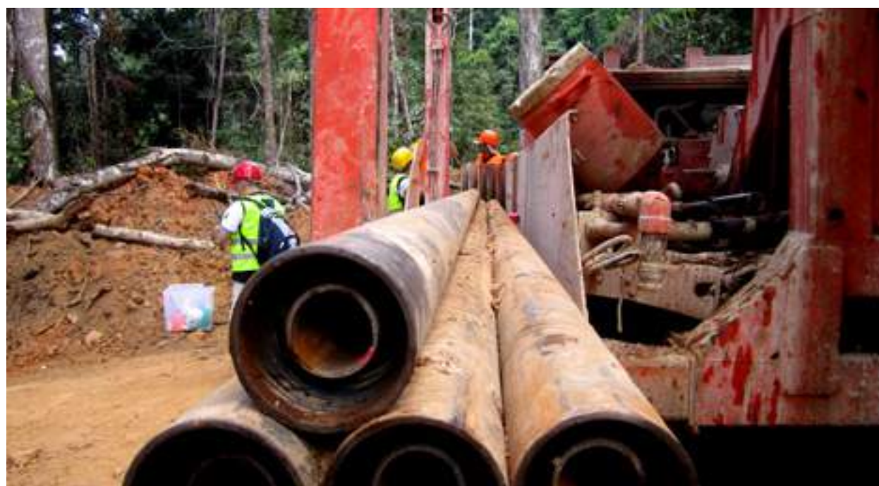
Photo: Drill pipes at drilling pad - Montagne d'Or gold project, French Guiana

On July 21 2016, the Company granted incentive stock options to an employee providing investor relations services for the purchase of up to an aggregate of 75,000 common shares at an exercise price of $0.70 per share for a period of 5 years. The options vested on October 28, 2016.