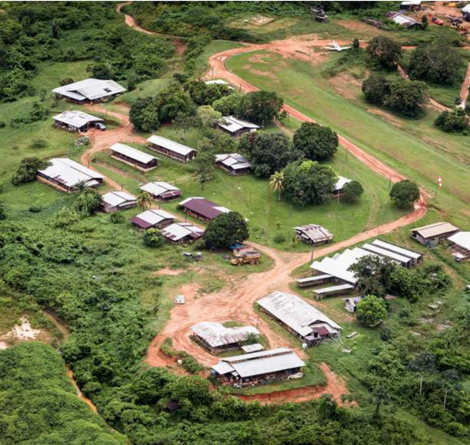
Photo: Camp Citron - Montagne d'Or gold project, French Guiana