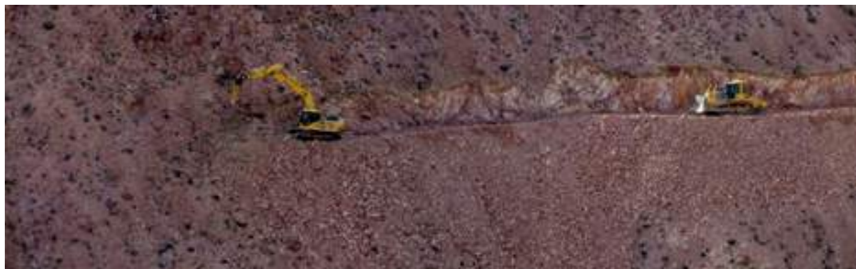
Photo: Road building - Eastside gold project - Nevada

Other accounting standards or amendments to existing accounting standards that have been issued but have future effective dates are either not applicable or are not expected to have a significant impact on the Company's financial statements.