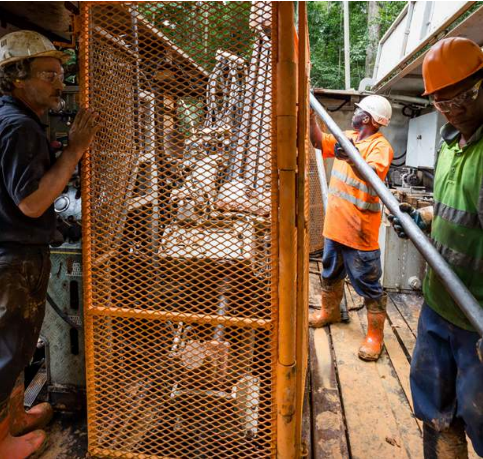
Photo: Drill rig - Montagne d'Or gold project, French Guiana