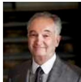
Dr. Jacques Attali Advisor