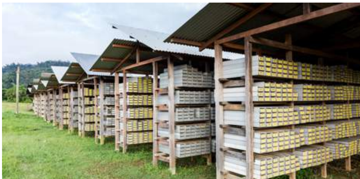
Photo: Drill core library - Montagne d'Or gold project, French Guiana