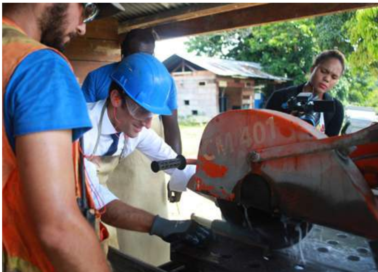
Photo: Emmanuel Macron, French Minister of Economy and Industry cutting core - Montagne d'Or, French Guiana