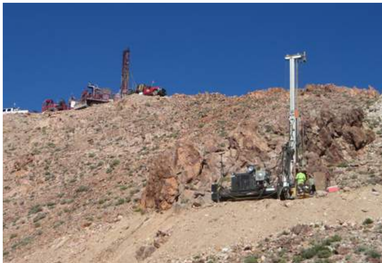
Photo: Drilling rigs at the Eastside gold project - Nevada