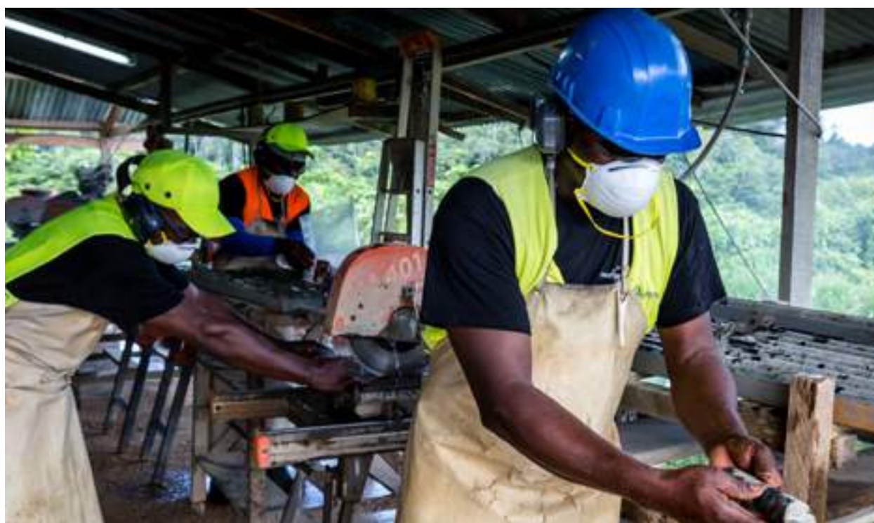
Photo: Workers cutting core - Montagne d'Or gold project, French Guiana

On November 26, 2014, the Company announced the completion of the Phase II drilling program. The Phase II program amounted to 126 diamond drill holes, for a total of 25,560 meters. In addition, six large diameter HQ-calibre core holes, for a total of 975 meters, were completed for comprehensive metallurgical tests.